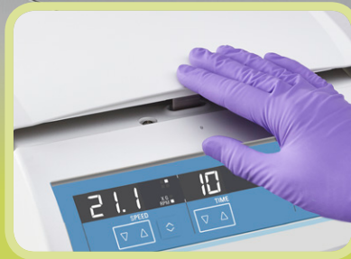
Fast one-click centrifuge lid closure